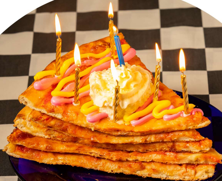
PIZZA BIRTHDAY CAKE WITH MUSTARD ICING